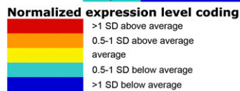
Fig. 1. Table of subplate-specific genes. Genes were identified as SP-specific at least at one age. The column “image based” indicates when a gene is specific to SP (early, from E15 but not until adulthood; continuous, E15–adult; late embryonic, during perinatal period; postnatal, P4/P8–adult). Gray labeling indicates that the image-based classification was made with an incomplete time series of images. Values reflect the fold change between SP and CP/L6a, but only if there is a “best match” between the ST1.0 and 430A

Patterns of Coexpression of Subplate-Enriched Genes. Comparing SP gene expression levels against L6a or CP gene expression levels to identify genes with higher expression in SP inherently biases against certain coexpression patterns, namely uniform expression levels across SP and CP/L6a. No such constraint exists for other coexpression patterns. See Fig. 3 for selected examples of commonly occurring spatial coexpression.