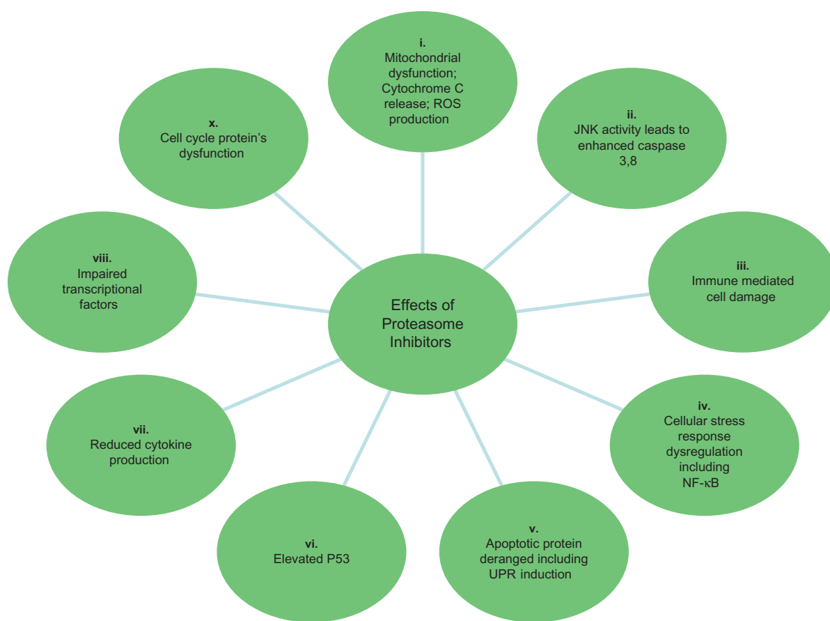
Figure 2. An overview of some major effects of proteasome inhibition. Notes: i. 103–105, 106 ii. 107 iii. 108,109 iv. 110–112 v. 113–119 vi. 120 vii. 121–123 viii. 124 ix. 111,112,125 x. 40 Abbreviations: JNK, c-Jun-N-terminalkinase; ROS, Reactive Oxygen Species.

Bortezomib stabilizes I \kappa B, a small regulatory unit of NF- \kappa B. NF- \kappa B is a heterodimeric cytoplasmic transcription factor and promotes transcription of several anti-apoptotic growth factors, proteins, and cytokines, in response to cellular stress and after its nuclear translocation. 41 NF- \kappa B is also constitutively upregulated in several MM cell lines. Stabilized I \kappa B binds NF- \kappa B, hindering its nuclear translocation and thus preventing the transcription of the following: (1) anti-apoptotic proteins such as Bcl-2, A1, cIAP-2, and XIAP; (2) cell cycle regulators cyclin-D1 and c-Myc; (3) growth and anti-apoptotic factors such as IL-6 and VEGF, which is essential for myeloma cells and bone marrow stromal-cell signalling; and (4) adhesion molecules such as vascular adhesion molecule (VCAM-1) and intracellular adhesion molecule (ICAM-1) (Fig. 2). 41,42 As NF- \kappa B is highly expressed in myeloma cells, 43,44 its inhibition by bortezomib promotes their apoptosis. Other mechanisms include: (a) stimulation of classical stress response proteins; (b) mitochondrial calcium transport