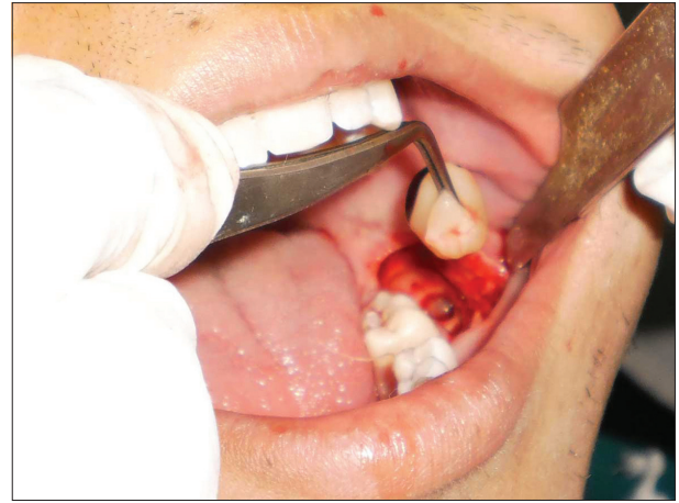
Figure 6: Platelet-rich fibrin application in mandibular left 3 rd molar socket