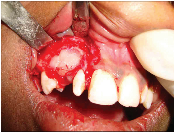
Figure 7: Platelet-rich fibrin application in cavity created post surgical removal of impacted right permanent maxillary canine

wounds as this matrix also contains leucocytes, and promotes their migration. Fibrin and its degeneration products help in natural support to immunity by modulating cluster of differentiation receptors, such as, CD11/CD18 receptors etc. With this in mind, PRF is routinely used at our institute in various surgical procedures, e.g., post enucleation of large periapical lesions [Figure 5], surgical removal of impacted third molars [Figure 6] and impacted canines [Figure 7], preprosthetic surgeries, graft stabilization in various procedures, placements of implants in borderline cases, etc. with satisfactory results. Cavities filled with PRF showed complete healing in half the time as compared to time required for physiologic healing. Our clinical experience together with various in vivo and in vitro studies in literature, confirms the potential of PRF as a good healing biomaterial. [7]