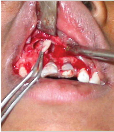
Figure 5: Platelet-rich fibrin application in periapical lesion in the region of upper anterior teeth