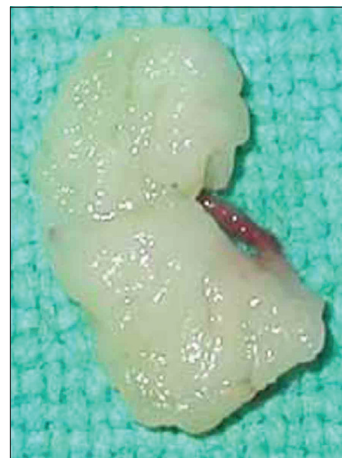
Figure 4: Platelet-rich fibrin ready for use