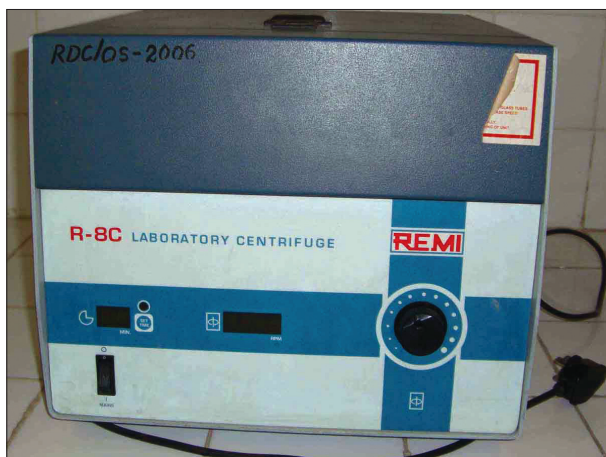
Figure 1: Centrifuge machine used for preparation of Platelet-rich fibrin from blood samples in the vacutainer tubes

The PRF preparation protocol is very simple and armamentarium required is same as that of PRP. Around 5 ml of whole venous blood is collected in each of the two sterile vacutainer tubes of 6 ml capacity without anticoagulant. The vacutainer tubes are then placed in a centrifugal machine [Figure 1] at 3000 revolutions per minute (rpm) for 10 minutes, after which it settles into the following layers: red lower fraction containing red blood cells, upper straw coloured cellular plasma and the middle fraction containing the fibrin clot [Figure 2]. The upper straw coloured layer is then removed and middle fraction is collected, 2 mm below lower dividing line, which is the PRF [Figure 3]. The mechanism which is followed here is that, fibrinogen which is