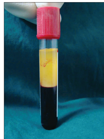
Figure 2: Blood in the vacutainer tubes after centrifugation at 3000 rpm for 10 minutes divided into three fractions; lower fraction of red blood cells, middle fraction containing fibrin clot and upper acellular plasma fraction