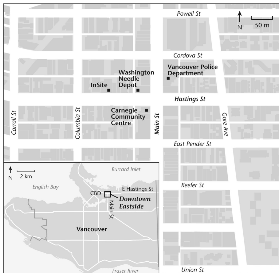
Figure 1 Map of the Downtown Eastside of Vancouver.

The city's proximity to Vancouver's DTES is unique because many IDUs can access InSite by travelling on the train for 45–60 minutes. Finally, Victoria, is a small city located on the southern tip of Vancouver Island. The city's Downtown neighborhood was chosen as a