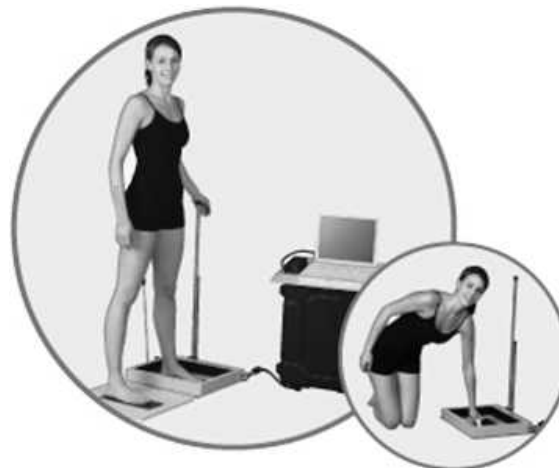
Figure 1. Perometer. A perometer uses arrays of light switches made up of light-emitting diodes to illuminate, scan, and calculate the volume of an extremity in milliliters (mL). Lower leg volume was calculated from the medial malleolus to the tibial tuberosity and was measured with the participant in a standing position.

Lower leg volume of both legs was measured with a perometer before, immediately after, and at 5 minutes and 30 minutes after both the 10-km run on the track and the maximum exercise test. A perometer uses arrays of light switches made up of light-emitting diodes to illuminate,