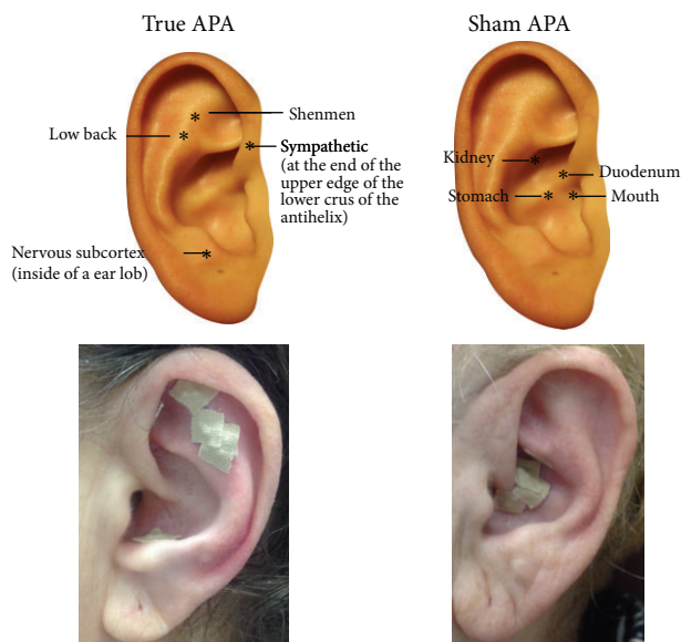
FIGURE 1: Acupoints for acupressure treatment.