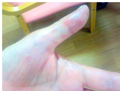
Figure 4 Resolved nodes after the treatment.

reported to occur in lupus, they are strongly suggestive of bacterial endocarditis. 3