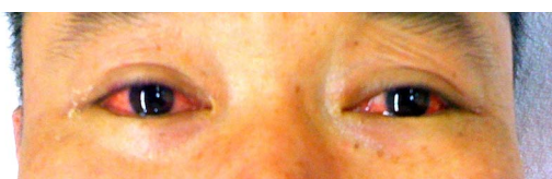
Figure 2 Conjunctival haemorrhages.