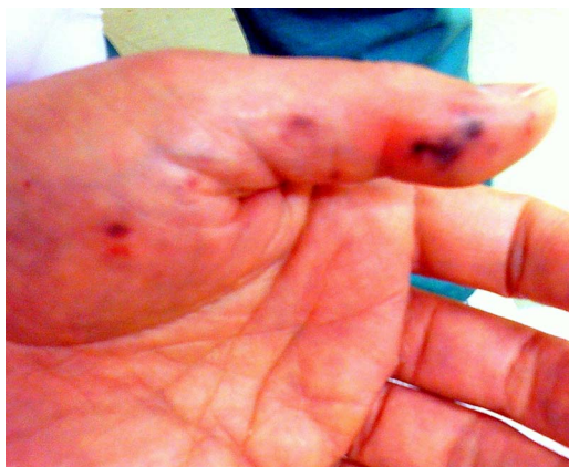
Figure 1 Palpable and painful violaceous nodules left thenar eminence.

Osler's node, first described by William Osler, 1 is associated with chronic (subacute) bacterial endocarditis. Cultures of Osler's node have generally been negative. 2 The culture of the nodes in this case was negative. 2 Although Osler's node is