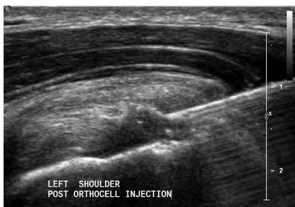
Figure 2 Ultrasound-guided autologous tenocyte implantation.

Provenance and peer review Not commissioned; externally peer reviewed.