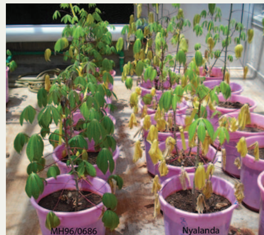
Fig. 1 Effect of drought stress on improved MH96/0686 cassava genotype and landrace Nyalanda. Stress treatment was gradually given to the plants 60 days after planting. Moisture stress was gradually applied to mimic natural field drought conditions. Improved MH96/0686 and farmer preferred landrace Nyalanda were differentially affected by drought stress conditions. After 10 days of gradual application of drought stress, MH96/0686 was less affected by water stress than Nyalanda, which exhibited marked wilting and other drought stress symptoms.

At T0 (day 1/first day of drought treatment), the two genotypes were healthy and exhibited no readily observable symptoms of drought stress. After 10 days of reduced SMC, the two genotypes exhibited different levels of drought stress: the DS genotype Nyalanda showed severe wilting symptoms on the leaves, including mild chlorosis of upper leaves and senescence of many of the lower leaves, compared with more limited stress signs in the DT genotype MH96/0686 (Fig. 1). In order to assess the drought stress response in leaves that were at the onset of visible stress in the DS genotype at the 10-day time point, RWC and stomatal