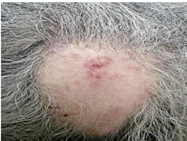
Fig. 2. Herpes zoster lesion in the center of an alopecia areata plaque.