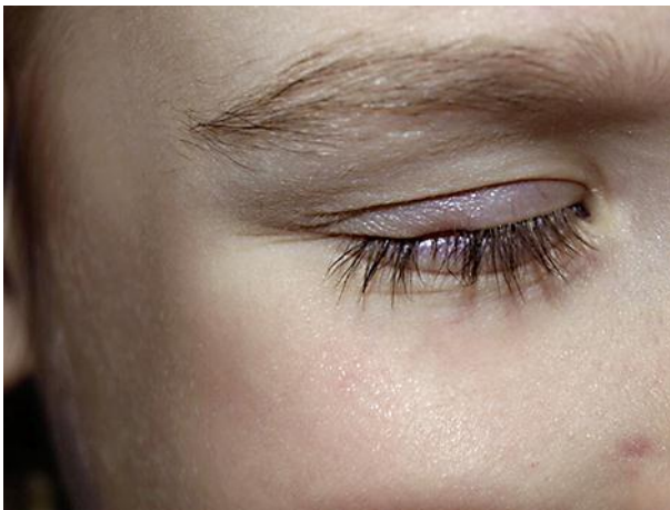
Fig. 1. Persisting upper right eyelash hair loss 3 months after the resolution of chickenpox. Note several cutaneous chickenpox scars.