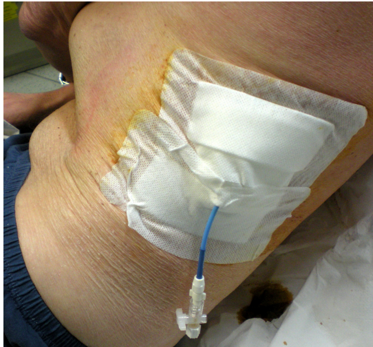
Figure 5 Catheter drainage: the pigtail catheter is inserted in a very low, lateral position (between mid and posterior axillary lines). In this way, it is not compressed by the patient lying in dorsal decubitus and may easily drain the pleural effusion.

expressed as mean \pm standard deviations and categorical data. The differences between groups were calculated using independent t -test, Mann-Whitney and Wilcoxon non parametric test, where appropriate. A p less than 0.05 was considered significant.