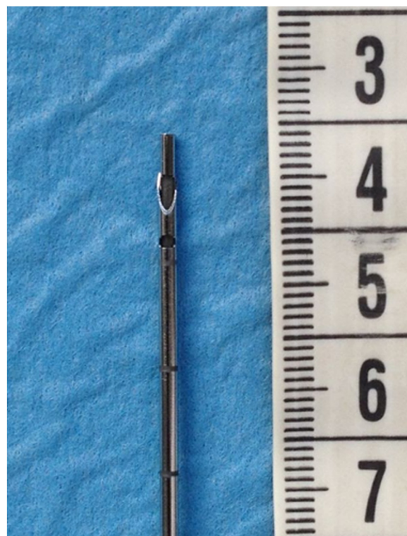
Figure 4 15-gauge Veres needle: detail of the tip.

A statistical analysis was performed using SPSS v.13.0 for Windows software (Chicago IL, USA). Results were