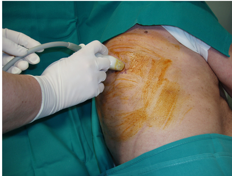
Figure 1 The patient lies in lateral recumbent position with the side to be drained on top. The operator localizes the costophrenic sinus in the basal, postero-lateral region of the chest with a Convex probe.

linear probe was used for anesthesia and for all the real time ultrasound guided interventional procedures.