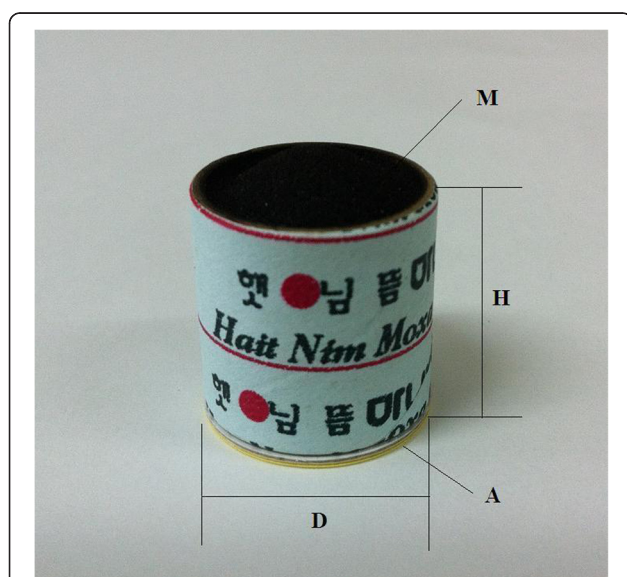
Figure 2 Moxibustion device. A photograph of the moxibustion device that will be used in this trial. This moxibustion device is a sticker-type disposable moxa, which functions for 5–10 minutes and is used for local acupuncture points. M: the upper part of the carbonised mugwort, A: adhesive sticker, H: height (2.1 cm), D: distance (1.9 cm).

The primary outcome with respect to the effectiveness on KOA will be the mean change in the global scale value of the Western Ontario and McMaster Osteoarthritis Index (WOMAC) from baseline to 5 weeks. The WOMAC is