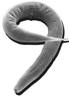
Figure 1. The nematode Pristionchus pacificus .

and Sommer 2011; Morgan et al. 2012) in P. pacificus allow for full exploitation of this model system from all aspects of development, genetics and ecology (e.g. Bento et al. 2010).