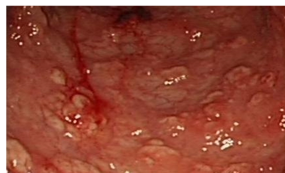
Figure 2 Transverse colon seen during endoscopy.

Histoplasmosis, caused by H. capsulatum , is generally seen in immunocompromised hosts, especially HIV/AIDS patients [1,2]. It also occurs in immunocompetent individuals and frequently presents as an asymptomatic