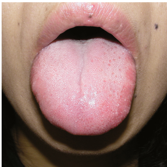
Figure 3 Representative photograph of the tongue 7 years postoperatively. The taste buds can be observed on the surface of the regenerated (right) side of the tongue, but their sizes and quantity were smaller than those of the healthy (left) side.

sensation exhibited objective recovery changes as measured by electrogustometry and the filter-paper disk method. Delayed recovery and a long period of time were required to reach the normal level compared with somatosensory sensations. Moreover, subjective recovery of taste sensation emerged later than objective recovery. This may be related to a central reorganization mechanism