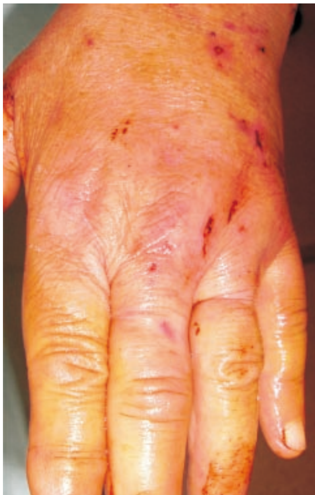
Figure 1. The image of the patient's hand shows tense bilateral swelling and erythema, the puncture wounds and scratches on the dorsum of the hand can be noted to have epithelialised and no active bleeding or extrusion of pus was seen.

simultaneously. With movement of the digits, the tendons retract and carry bacteria to more proximal locations. Furthermore, the epithelialization of the puncture site creates an ideal environment for the inoculated bacteria to flourish [4,5] . Thus, clinically, trivial puncture wounds can result in significant clinical morbidity.