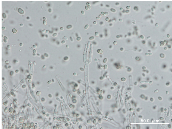
Figure 2 The fruiting structures (penicilli) of Penicillium from this patient have a brush-like appearance; the spores of Penicillium digitatum are typically elliptical under the microscope.

in cultured reference colonies [1]. This fungus was confirmed to be P. digitatum by molecular identification. Partial sequences of the \beta -tubulin gene determined by using the primers Bt2a and Bt2b [5] underwent BLAST analysis at the National Centre for Biotechnology Information.