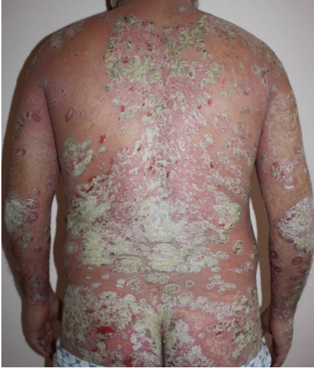
FIGURE 1: Severe plaque type psoriasis involving the face, scalp, trunk, and limbs.