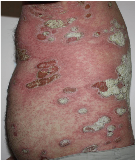
FIGURE 2: Generalized erythroderma characterized by tiny pustules which has developed 4 days after the second injection.