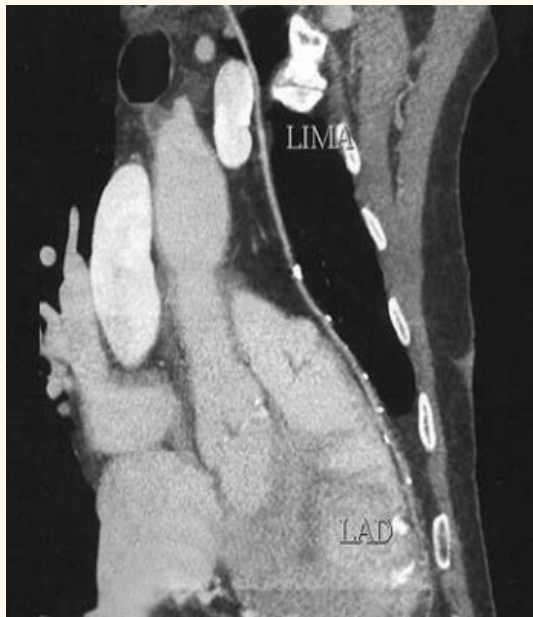
Figure 4: Reconstructed image of a post-operative computed tomography angiogram showing good flow in the left anterior descending artery through the left internal mammary artery.

to relative differences in the diastolic pressures between the pulmonary and systemic arterial beds, or 3) Massive collateralisation may maintain adequate myocardial perfusion even in the presence of the steal phenomenon.