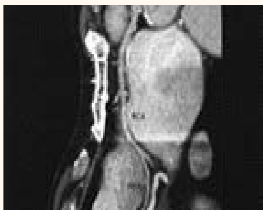
Figure 2: A reconstructed image of a postoperative follow-up computed tomography angiogram showing the proximal anastomosis of the right coronary artery to the ascending aorta with no evidence of kinking or angulation and the full course of the right coronary artery.