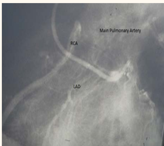
Figure 1: Pre-operative angiogram showing a normally arising left anterior descending artery (LAD) with the right coronary artery filled in a retrograde fashion by collaterals from the LAD and draining into the pulmonary artery.

discharged 7 days after the procedure having been prescribed anti-platelet medications, including aspirin and ticlopidine as per the hospital protocol.