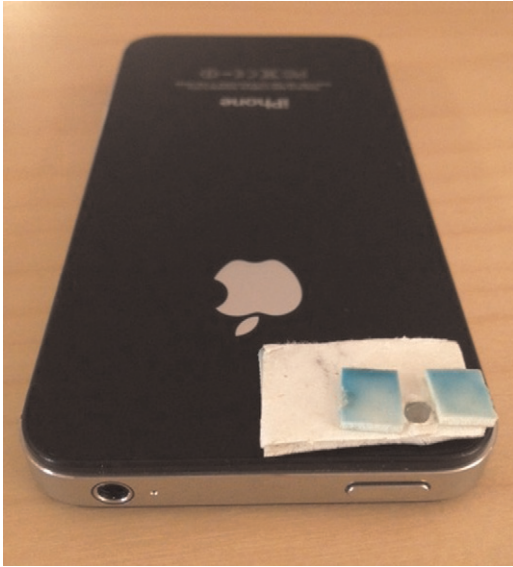
FIGURE 1. Mobile phone microscope apparatus with 3-mm ball lens embedded into double-sided tape and fixed over the iPhone camera lens. Note that the double-sided tape flanks the 3-mm ball lens to ensure a 1-mm space between the lens and glass slide.

as a reasonable standard for diagnosis. Comparisons were made between any helminth egg visualized on mobile phone microscopy and conventional microscopy, regardless of the correct species diagnosis. We also assessed the diagnostic accuracy for each soil-transmitted helminth species separately. In addition, diagnostic accuracy was evaluated for low-, moderate-, and heavy-infection intensities using the cutoffs described by the World Health Organization (WHO). 7 Moderate- and heavy-infection intensities were combined into a single category. Because we selected out positive slides in the evaluation of low- and moderate/heavy-intensity infections, we could not assess for specificity, PPV, and NPV, because by definition, there were no false-positive slides from conventional microscopy.