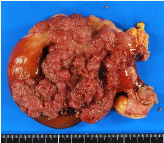
Fig. 2. Resected specimens of the tumor. Histopathological examination revealed papillary adenocarcinoma in villotubular adenoma.