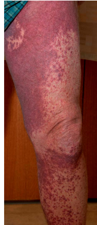
Figure 2 Rash involving the lower extremities.

Cytarabine is an antimetabolite which is used in the treatment of AML. It has been associated with florid cutaneous reactions. 3 4 These reactions have been found to be dose related. 3 4 Most of