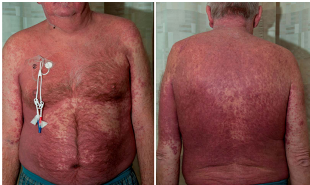
Figure 1 Maculopapular erythematous rash all over the trunk.

them have spontaneous resolution. 3 4 Exact cause remains unknown though hypersensitivity reaction is strongly implicated and proinflammatory