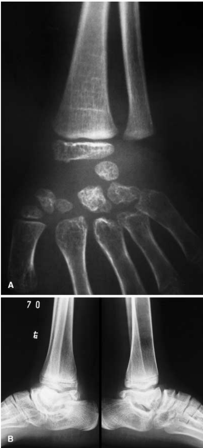
Fig. 2 A Carpal bone lesions in a 6-year-old boy. B Bilateral lesions of the talus in a 15-year-old girl

carpus and tarsus were classed as epiphyseal lesions and when present were often very advanced (Fig. 2). The frequency and sites of the lesions are shown in Fig. 3. An obvious proximo-distal gradient is seen, with more lesions seen distally than proximally. The lower limb is more frequently and more severely affected than the upper limb. A lesion of the foot and ankle is present in