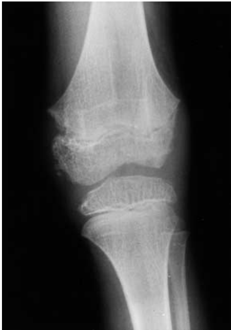
Fig. 5 Radiographic changes in the distal femur of a 6-year-old boy

been able to describe for the first time in Tibet the characteristic radiological features of KBD in the appendicular skeleton. Bone maturity was delayed in all our KBD populations and controls in endemic and non-endemic areas. The delayed bone maturity appeared not to be spe-