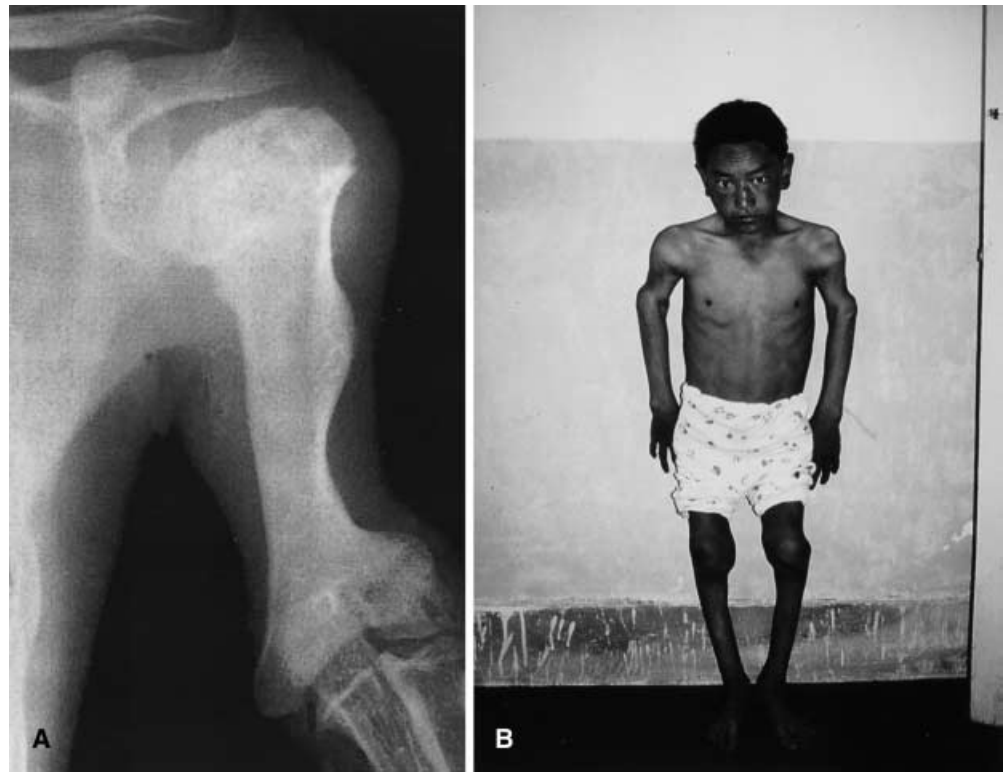
Fig. 4 A Characteristic shortening of the humerus in a 16-year-old boy. B Clinical appearance of the patient