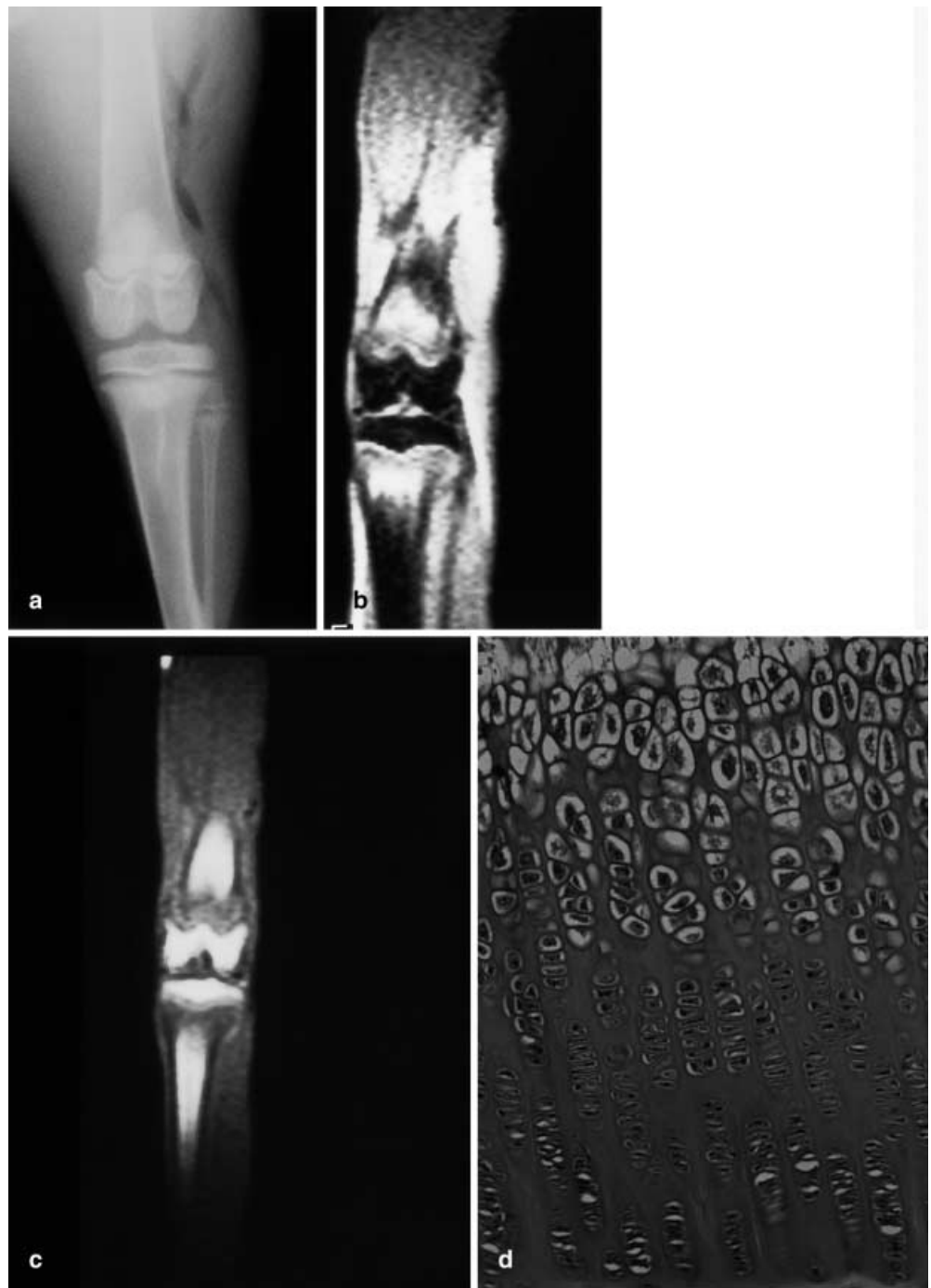
Fig. 1a–d The normal rabbit knee at 6 weeks. a. Anteroposterior radiograph. b. MRI: normal gradient echo image (450/20/20). c. MRI: normal T1-weighted image (450/20). Note high signal intensity in proximal tibial growth plate ( arrows ), and broad band of increased intensity in the adjacent metaphysis. d. Histological section of the normal growth plate (200 \times ). Note regular chondrocyte columns