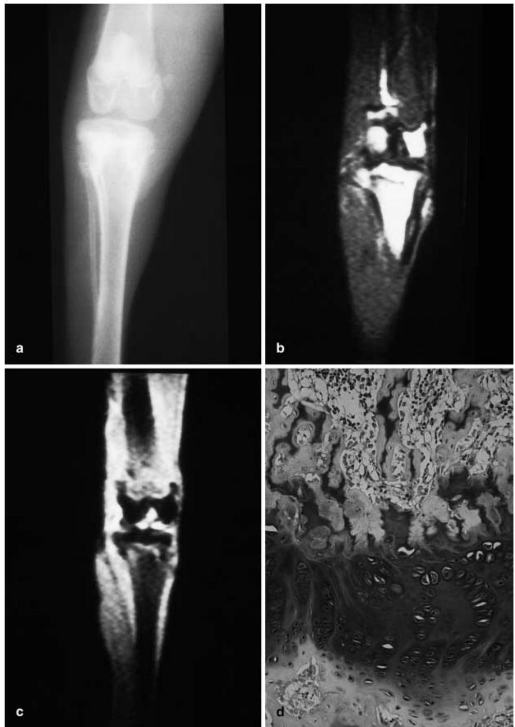
Fig. 3a–d Growth plate changes in the rabbit knee 4 weeks following epiphysiodesis. a. Radiograph with complete bone bridge formation. b. T1-weighted MRI (450/20). Note bone bridge formation medially and laterally. c. Gradient echo MRI (450/20/20). There is loss of the high signal cartilage at the growth plate margins and no increased signal in the central adjacent metaphysis. d. Histology of the growth plate (200×). Chondrocyte orientation is totally disrupted and disorganized

showed minor architectural disarray in the chondrocyte columns; however, the width of the growth plate was only minimally decreased (Fig. 2c).