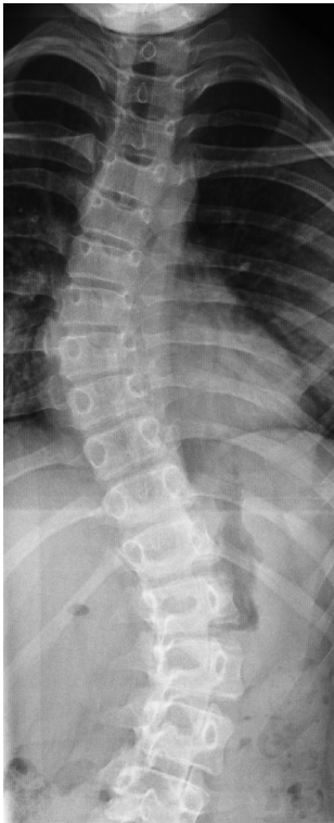
Fig 5 Patient aged 14 years; bracing.