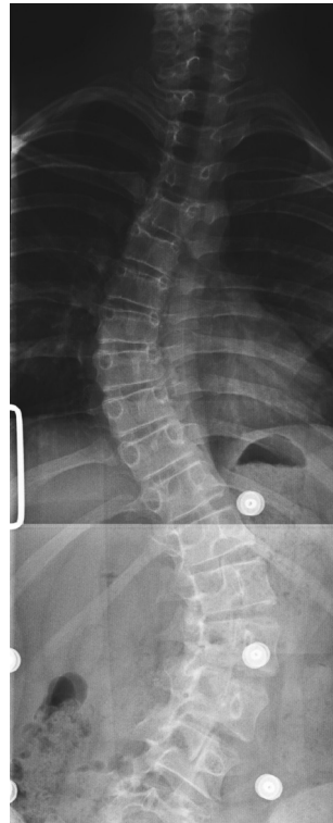
Fig 7 Patient aged 15 years; bracing.