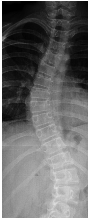
Fig 6 Patient aged 14 years; at 6 months, bracing.