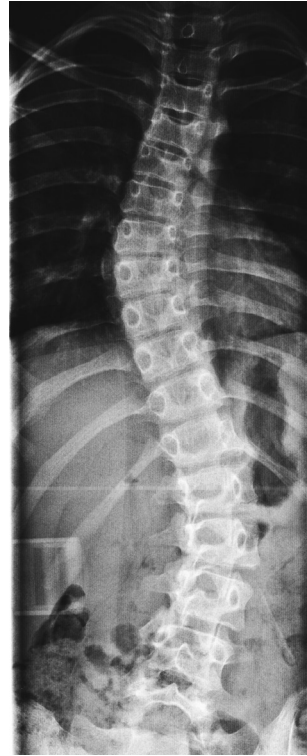
Fig 3 Patient aged 13 years. No treatment.