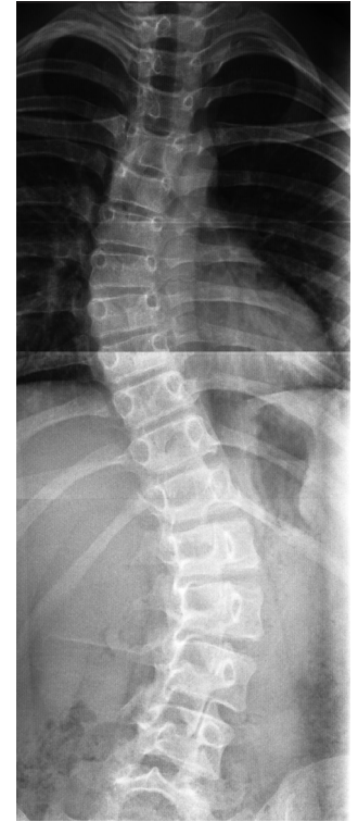
Fig 4 Patient aged 13 years; at 6 months, progression and start bracing.