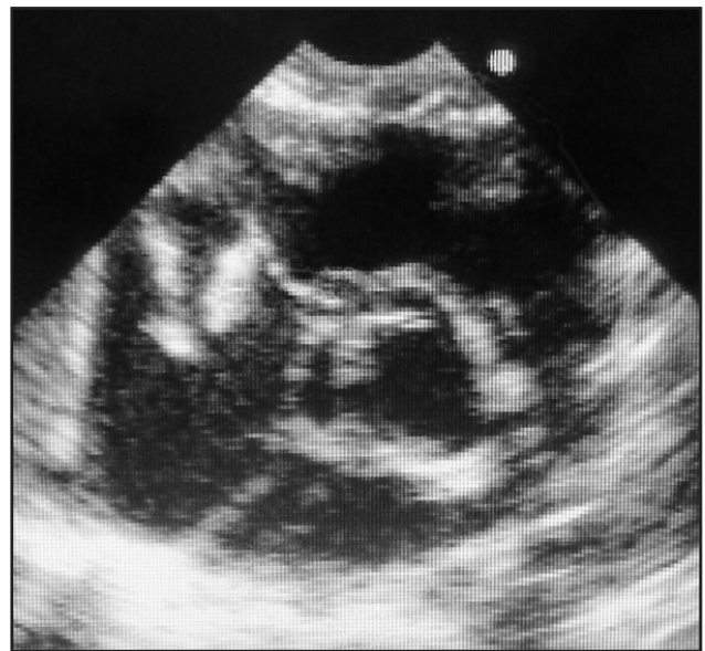
Figure 2: Parasternal short axis echocardiogram showing tricuspid valve vegetations (labelled 'V') in right atrium during systole. RA - right atrium, RV - right ventricle, A - aorta.

In view of her chest x-ray, an echocardiogram was done which showed a large oscillating intracardiac mass (vegetation) on the tricuspid valve and tricuspid valve regurgitation. There was no other cardiac abnormality, in particular no ventricular septal defect or left to right shunt producing a jet impacting on the tricuspid valve (Figures 2 and 3).