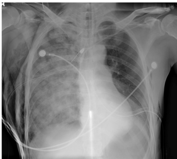
Figure 2 Severe reexpansion pulmonary edema on the right side of the chest was noted after tube thoracostomy.

Simultaneous bilateral tension pneumothorax has rarely been reported [1,4,5]. Such cases usually present in a critically ill and life-threatening state. Although immediate chest x-ray could confirm the existence of tension pneumothorax, the deteriorated condition of patients with simultaneous bilateral tension pneumothorax requires emergent endotracheal intubation and positive airway pressure ventilation