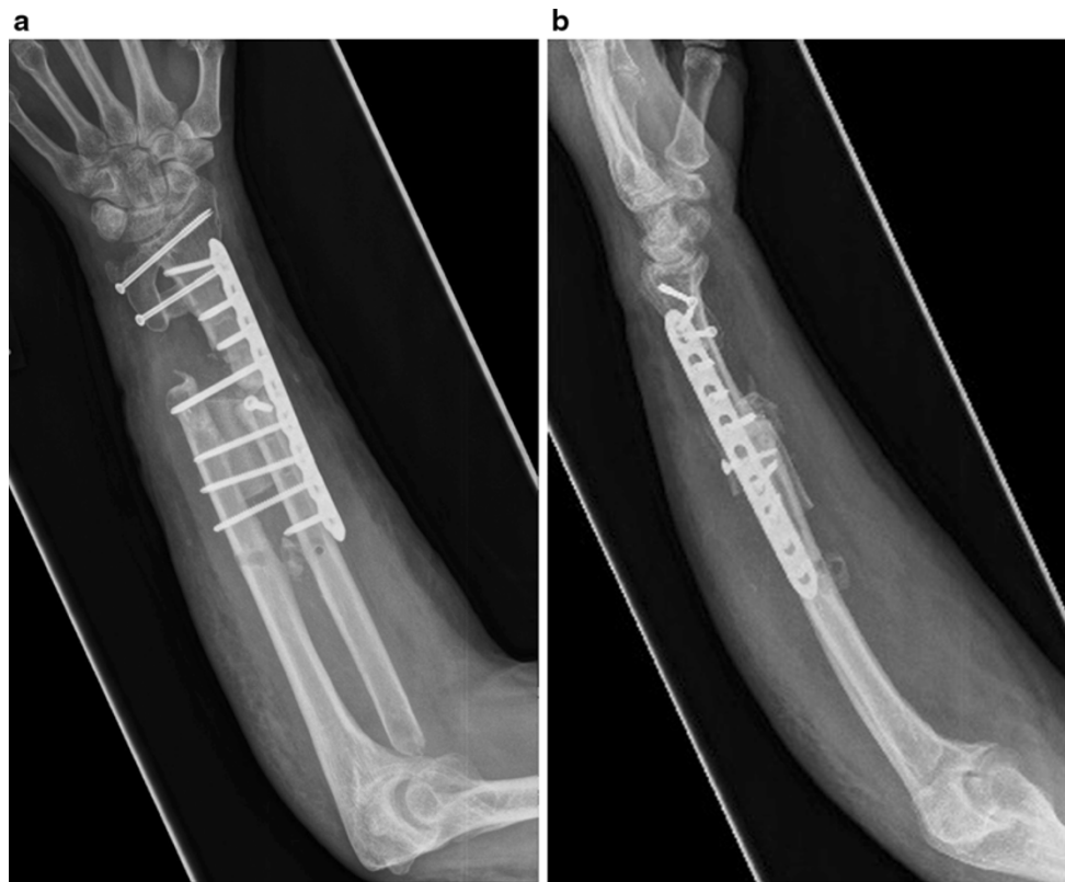
Fig. 4 AP and lateral forearm radiographs of the healed one-bone forearm

optimal management of chronic interosseous membrane insufficiency is still evolving, what is certain is that prompt diagnosis optimizes outcome. Careful clinical and radiological examination of the wrist in all significant elbow injuries is strongly advocated to avoid a missed diagnosis. If interosseous membrane lesions are suspected, sonography or magnetic resonance imaging (MRI) should be performed preoperatively. Furthermore, longitudinal stability should be verified intraoperatively—e.g. using the radius pull test—to exclude falsely negative MRI or sonography reports.