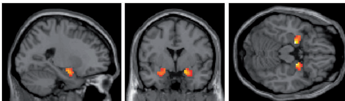
Fig. 2 Amygdala activation for the main effect of task (emotional vs scrambled faces).

Following the extraction of Amygdala and mPFC activations (using MARSBAR), we ran correlation analyses to further investigate whether average Amygdala activation for all facial expressions was related to average mPFC activation for all facial expressions, within the No Abuse or CEM group.