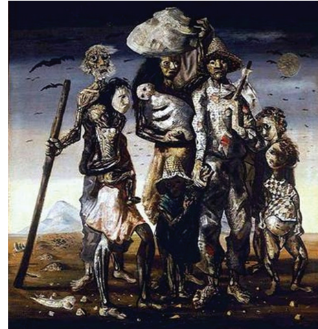
FIGURE 1: Rural retirement . Picture by Candido Portinari (Brazil) In ngeladohs.blogspot.com (accessed in Sept. 12, 2012).

countries usually suffer with neoliberal policies, in terms of underemployment, low salaries, inequity, and strong dependency of international capitals and of the global market ( http://wikimediafoundation.org/ , access in June 27, 2011). Particularly, this situation used to be responsible for the intensive migration process all around the world. Regarding LA, after two decades of Neoliberalism, the World Bank evaluation in 2005 considered that the results (in terms of economic growth) remained much lower than it was formerly awaited [24, 26].