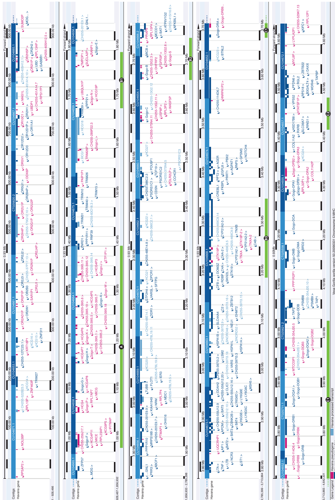
Figure 1. Feature map of the gorilla MHC, modified from the VEGA browser (release 50, December 2012). Each locus is labelled with a name, coloured according to type (see legend at bottom) and with indication of orientation (angle bracket before or after the name) and position within the region. The tiling path of the sequenced BACs is shown at the top of each panel (labelled contigs), with clones in alternating dark and light blue and, space permitting, with accession numbers. At the top and bottom of each panel, a size scale is shown. The regions highlighted in Figure 2 are marked with green bars at the bottom of a panel and labelled with the figure section identifier.