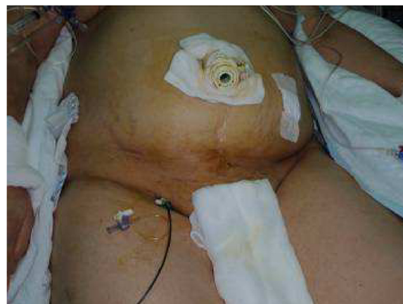
Figure 4 Leaving the laparoscopic port in place after laparoscopic evaluation of the abdomen may enable a quick and easy way of second-look after local thrombolytic therapy.

In conclusion, acute arterial mesenteric ischemia remains one of the most lethal conditions in patients presenting