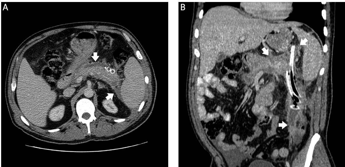
Photo 2. The same patient as in Photo 1. Axial contrast enhanced CT scan (A) and multiplanar reconstruction (B) show postnecrotic pancreatic/peripancreatic fluid collection after drainage (white arrows)

drain was placed there. During repeated retroperitoneoscopic necrosectomies, the trocars were inserted through the same apertures along with drain tracts.