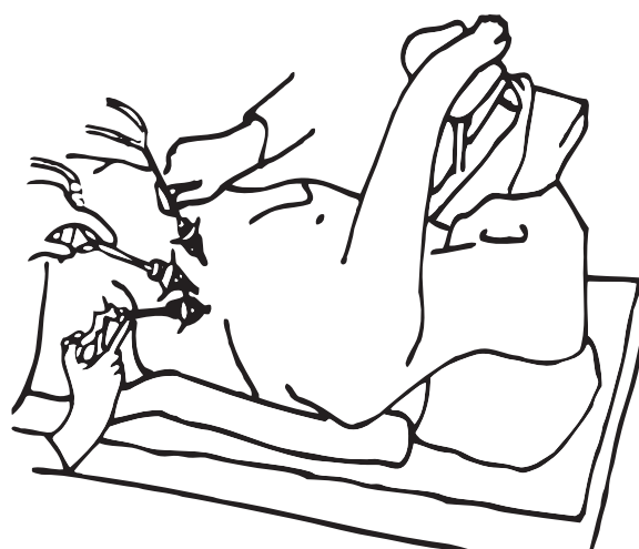
Figure 2. Placement of video scope, suction irrigator, and forceps during retroperitoneoscopic necrosectomy [1] (with permission)