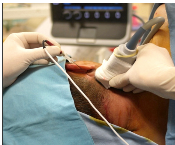
Fig. 2. Craniocaudal insertion of needle electrode using in-plane technique.