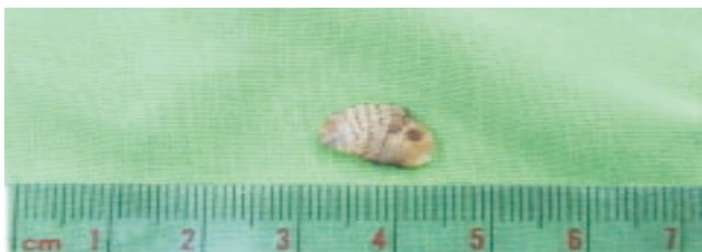
Figure 2. Morphological characteristics of a third instar larva of D. hominis extruded from the furuncular lesion of this patient, characterized with a size of 7 mm×12 mm and the rows of black spines that resist extraction of larva.

A: Furuncle-like nodules (arrows) located on the scalp of a 29-year-old man; B: A regional swelling of lymph node observed on his neck.