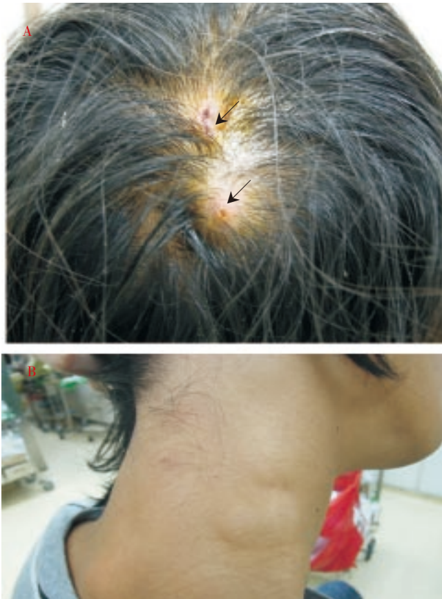
Figure 1. Physical examinations.

furuncle-like lesion [11] . A third instar larva of D. hominis was further identified by the entomological specialist based on its morphological characteristics (Figure 2). Because of the presumed bacterial infection, the patient was treated and prescribed with a 7-day course of antibiotic. The patient recovered completely with no further complication.