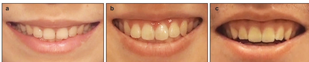
Figure 3 Upper lip curvature. (a) Upward. (b) Straight. (c) Downward.