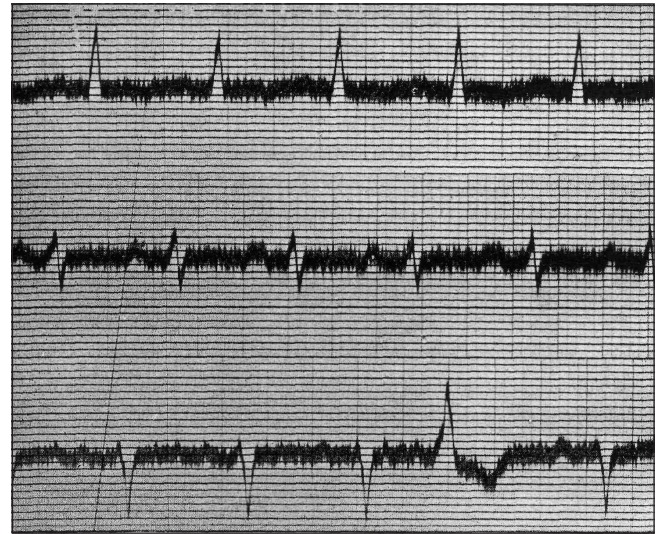
Fig 2. Leads I, II and III recorded by the string galvanometer. Spread of electrical excitation into ventricular muscle generates the QRS complex. Left ventricular preponderance is indicated by high R in Lead I and deep S in Lead III.

of the string movements we observe a series of waves, 'curves' or 'deflections' which are repeated regularly, each series representing the cardiac complex with the intervening pauses'. (Figures 2 and 3). Without identifying them by name