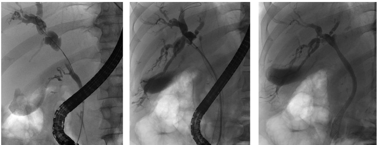
Figure 1 Positioning of a self-expanding metal stent

The stenting procedure was considered technically successful when the stent was placed across the stricture and initial biliary