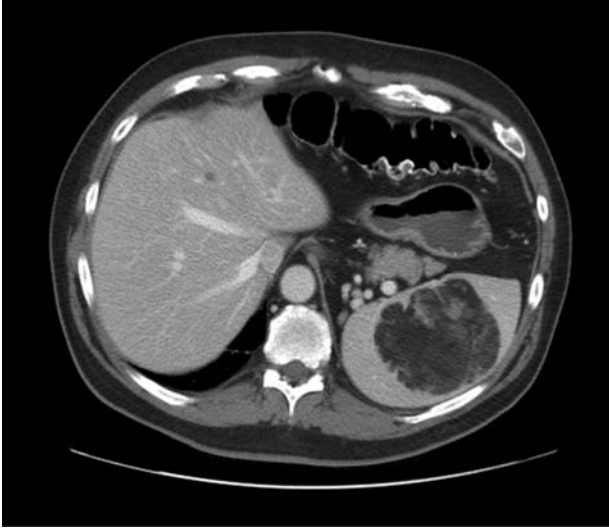
Figure 1: CT abdomen horizontal section with intrasplenic myelolipoma.