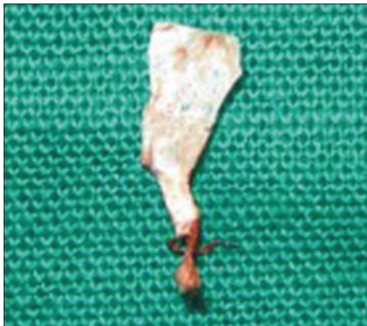
Figure 3: Gore –Tex® Regenerative membrane removed