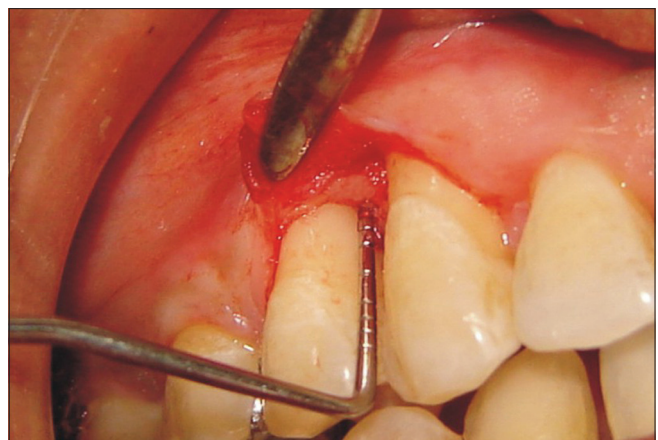
Figure 4: Rentry after 9 months of Expt. site –B