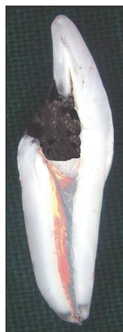
Figure 3: Maximum dye leakage was seen in experimental tooth specimens of group D

superoxol. TERM provided an unsatisfactory seal when used with walking bleach technique. However, when used over dry cotton pellets, TERM provided an excellent seal.