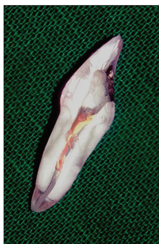
Figure 2: Minimal dye leakage was seen in experimental tooth specimens of group A