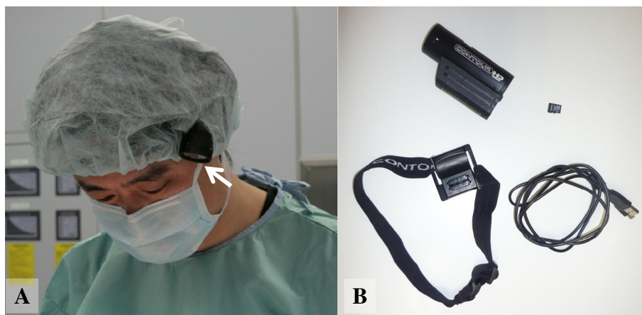
Figure 1 Commercially available head-mounted camera (ContourHD, Contour Inc., Seattle, Washington, USA.). A: We wear the camera (white arrow) under a surgical cap. Because the device is cordless, video recording can be quickly and easily prepared. B: The equipment used in our study is shown. It comprises (clockwise): the head-mounted camera; 16GB microSD card; USB cable for transferring digital data to a computer; elastic headband camera mount.

A 46-year-old woman sustained multiple stab wounds in the bilateral chest. On admission, she was agitated, with a systolic pressure of 78 mmHg, pulse of 121/min, and oxygen saturation of 90% on face mask. She was intubated and initial resuscitation was started immediately. The focused assessment with sonography for trauma was positive for pericardial fluid (see Figure 2A, Additional file 1). Despite fluid resuscitation with 1500 ml of lactated Ringer's solution, her condition deteriorated rapidly and she became pulseless, with a diagnosis of possible cardiac tamponade. A left anterior thoracotomy and a longitudinal incision over the pericardium were made, with care taken to avoid the phrenic nerve (see Figure 2B, Additional file 1). The findings were that of a massive hemo-pericardium, likely from a distal coronary artery, causing the tamponade. Coronary bleeding could be controlled with manual astriction and the incision was extended as a clamshell incision for detecting bilateral hemorrhagic spots and cardiac injury. She became hemodynamically stable and was then transferred