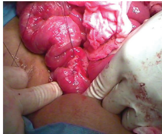
FIGURE 4: Suturing of base.

At laparotomy, a significant stump of the original appendix was left behind, inflamed with missed faecolith at the base of the appendix. It was perforated with abscess formation (Figures 3 and 4).