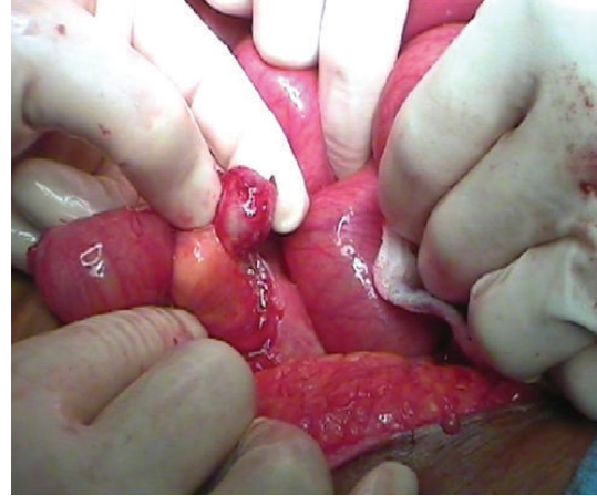
FIGURE 3: Residual appendix.

The patient underwent exploratory laparotomy through lower midline incision with a view to draining the abscess.