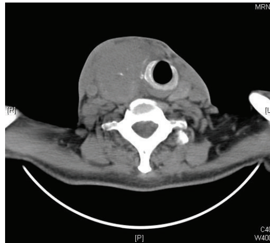
FIGURE 2: Computed tomography of neck showing left thyroid mass of size 8 \times 7.5 cm.

tumor. Stage was made pT2N0 M0. He had no other medical comorbidities and no history of smoking and her weight was stable.