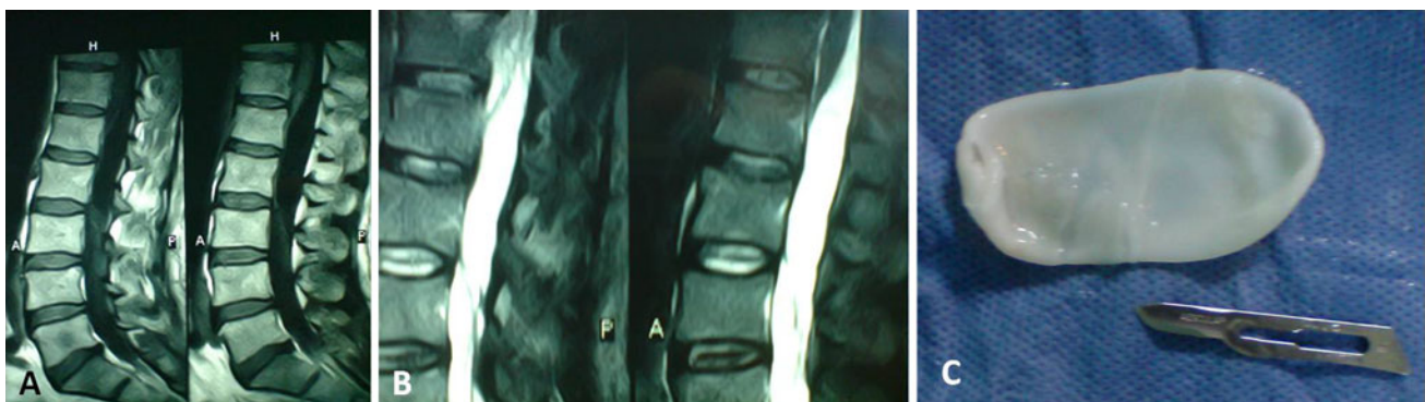
Fig. 1 a, b Magnetic resonance imaging of the lumbar spine showed a cystic lesion compressing the thecal sac, involving the L1–L2. c A classic milky-white cyst wall was excised

After the operation, the patient's neurological status improved, and he was discharged with instructions to