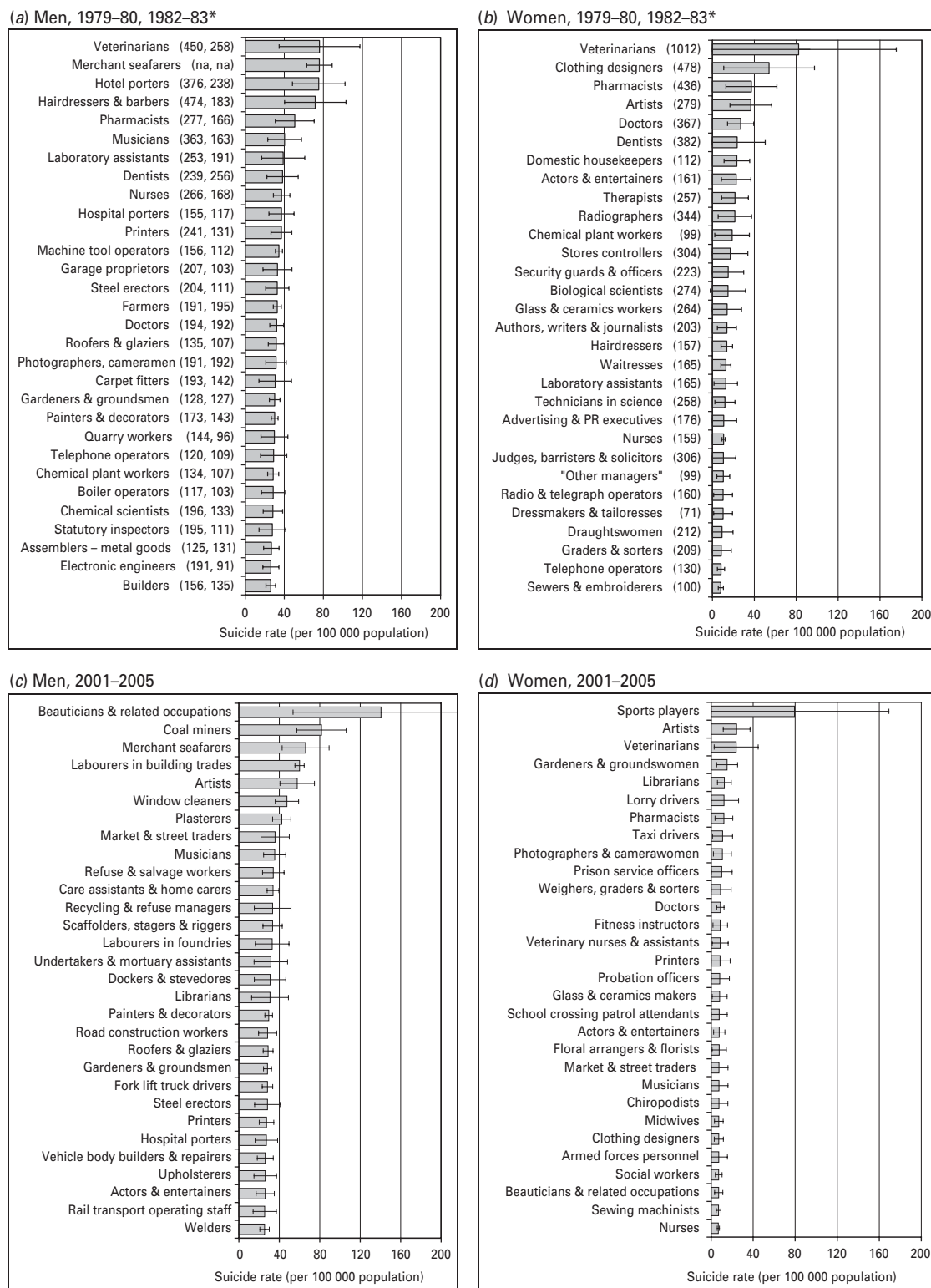
Fig. 2. Suicide rates for the 30 occupations with the highest suicide rates in (a) men, 1979–1980, 1982–1983, (b) women, 1979–1980, 1982–1983, (c) men, 2001–2005, and (d) women, 2001–2005. Values in parentheses are standardized mortality ratios (SMRs) and proportional mortality ratios (PMRs) for men and PMRs for women. Horizontal bars represent 95% confidence intervals. This figure includes only those occupations with at least 10 suicides among men, and three among women, in either time period, 1979–1980 and 1982–1983 or 2001–2005 (suicide rates were about three times higher among men than among women). N.A., Not available.