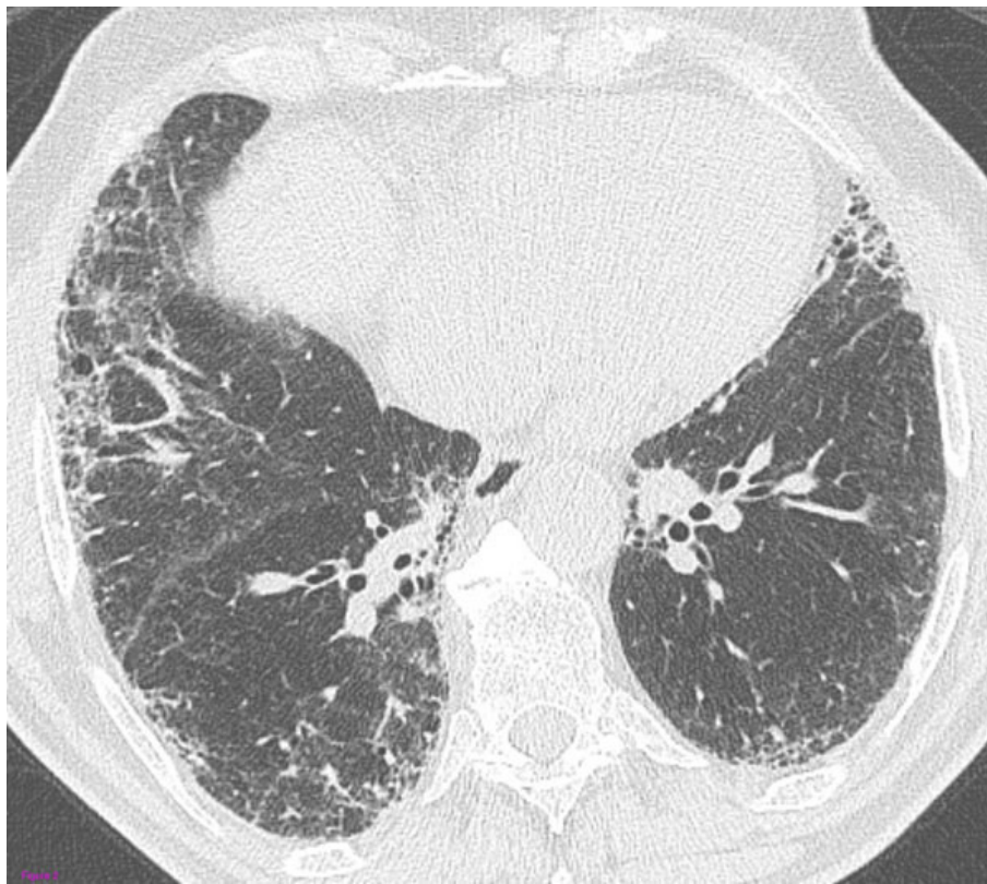
Figure 2 Biopsy-proved UIP with a possible UIP pattern at HRCT. The transverse HRCT image through the lower lobes shows patchy and peripheral reticular opacities without obvious honeycombing.