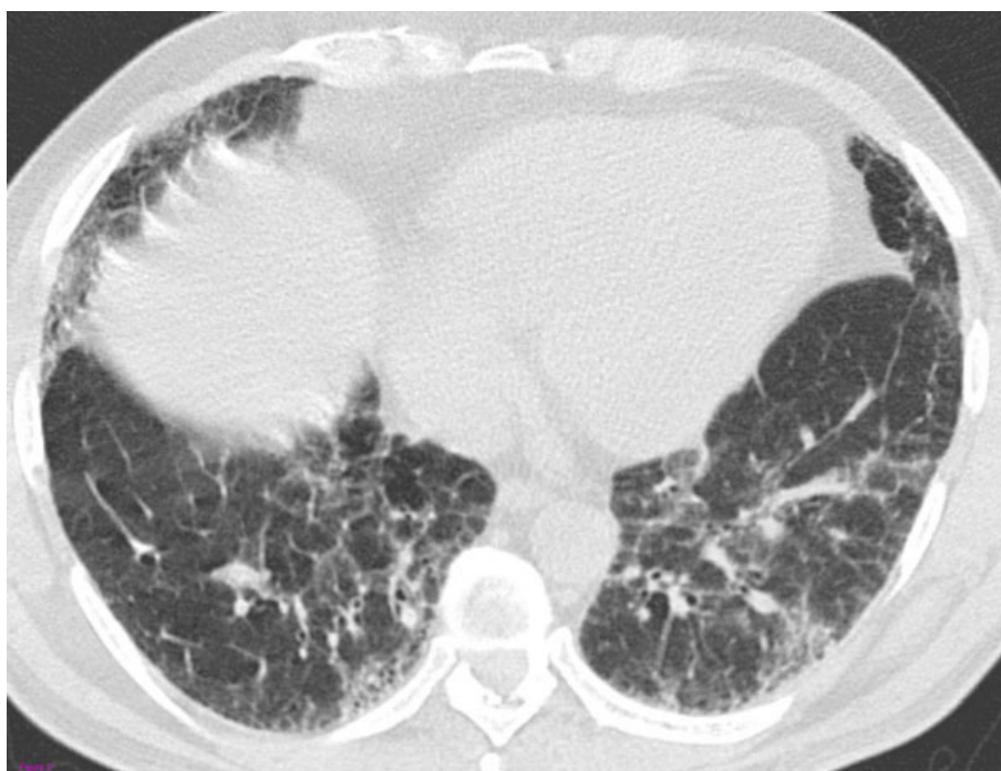
Figure 3 Biopsy-proved UIP with an HRCT pattern inconsistent with UIP. There are some patchy ground-glass and peripheral reticular opacities, which are more suggestive of nonspecific interstitial pneumonia (NSIP).