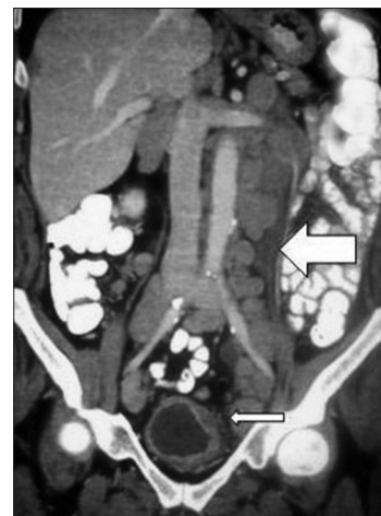
Figure 3: Computer tomography scan of the abdomen showing lymphadenopathies in abdomen of the patient

Although the patients with CLL may present with lymphoproliferative diseases and immunosuppression symptoms, pathological findings during the physical examination did