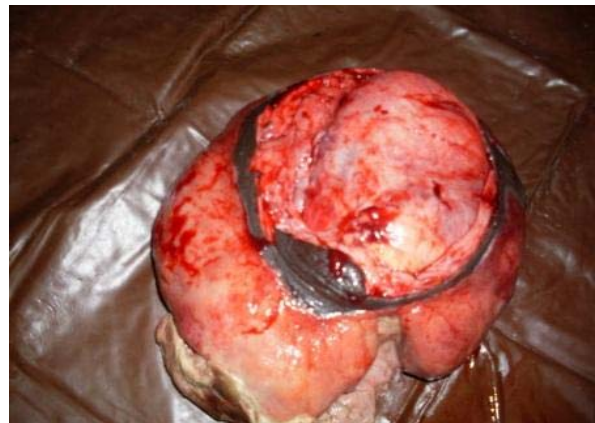
Figure 2: Excised breast mass measuring 20cm x 30cm and weighs 2,500gm

She was adequately resuscitated with intravenous fluid and antibiotics (intravenous Ciprofloxacin at 10mg per kilogram body weight and intravenous Metronidazole at 7.5 mg per kilogram body weight). She then had complete wide excision of the tumour with breast reconstruction. Operative findings included massively enlarged outer lobule of the left breast with ulcerative destruction of the nipple areolar complex. The deeper lobular structure of the breast was preserved. The excised breast tissue measures 25 cm by 30cm and weighs 2,500gm (figure 2).