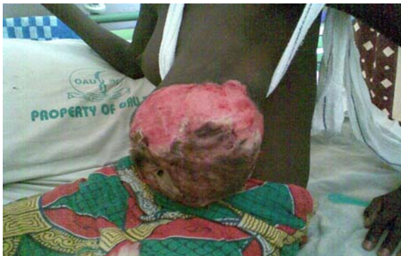
Figure 1: Picture showing huge giant fibroadenoma of the breast reaching below the umbilical level to the pelvis of the patient with destruction of nipple areolar complex

Physical examination essentially revealed an exhausted, pale, weak and tachycardic (pulse rate of 100 per minute, small volume but regular) young girl. She was not in painful distress. The left breast was hugely enlarged. Clinical measurement of the enlarged breast was about 30cm by 20cm (radius 10cm) (figure 1). This gives approximate breast volume of 3,000 mls where as the average breast volume in women in a study by katariya et al. using mammography measurements of length, radius and calculating with formula 1/3\pi r^2 l (r = radius, l = length on mammogram) which correlate well with clinical measurement is 690 mls – 790 mls 12 . The breast was enlarged and also reaching to the level of the pelvis of the patient. The left breast mass was firm in consistency, not tender, not attached to the underlying pectoralis major muscle. There was ulceration of the skin at the central part of the breast involving and destroying the nipple areolar complex (figure 1). There was associated purulent discharge, slough and necrotic tissue over the ulcer with occasional contact bleeding. The right breast was normal with no palpable mass. The lymph node of the axilla and the supraclavicular region were not palpably enlarged.