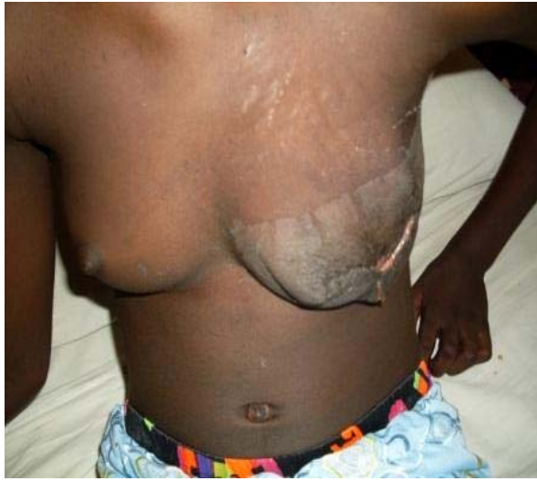
Figure 3: Post operative condition of the patient being followed up in the outpatient clinic