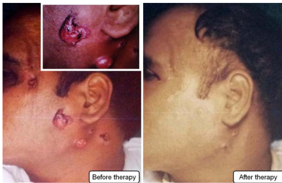
Clinical photographs of the multiple nodular facial lesions before and after antibiotic therapy.