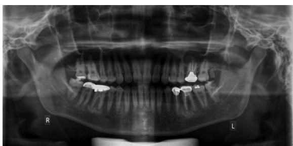
Orthopantomograph (OPG) showed infected left maxillary and mandibular third molars

Our patient was treated successfully with intravenous penicillin G, initially for 4 weeks, which reduced the lesions and trismus substantially. The patient was later put on oral systemic amoxicillin and clavulanic acid combination drug, Augmentin for few weeks, to achieve complete remission. A weekly monitoring was also done to see the patient's response to therapy.